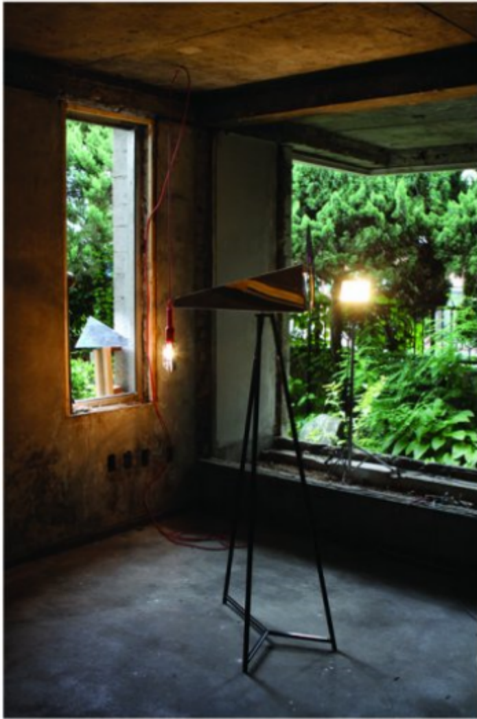
Collage leaves of grass, 2010, installation view kaleidoscope, light, mirror Songwoon Art Center, In Seoul, Korea