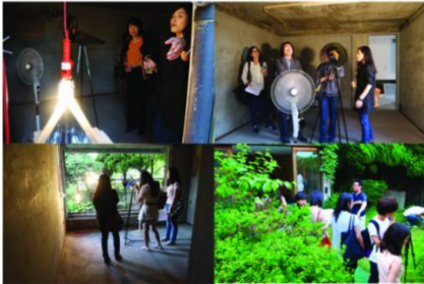
Collage leaves of grass, 2010, installation view kaleidoscope, light, mirror Songwoon Art Center, in Seoul, Korea